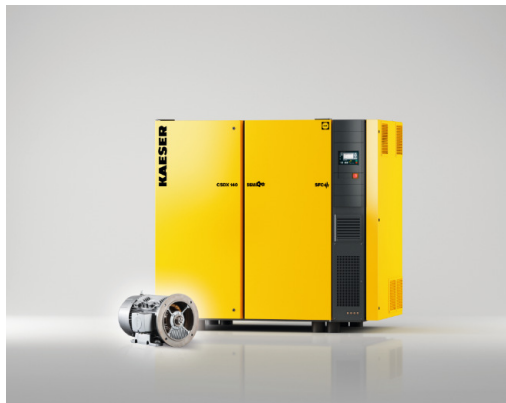
003_Image 1_KAESER CSD CSDX series.jpg

Caption: The variable-speed versions of Kaeser’s CSD/CSDX series rotary screw compressors feature a synchronous reluctance drive system from Siemens.