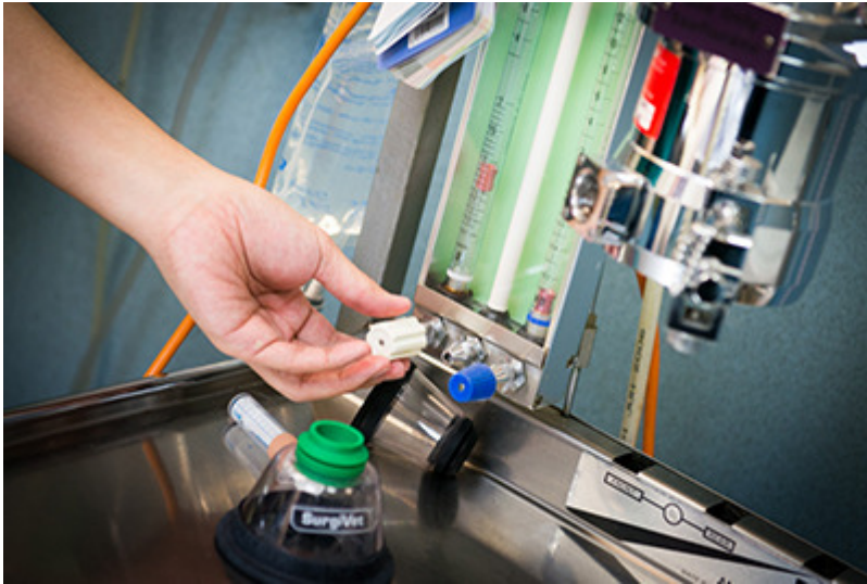
Caption: The oxygen supply plant allows the RSPCA Victoria's veterinary clinic in Burwood East to make its own oxygen as and when required.