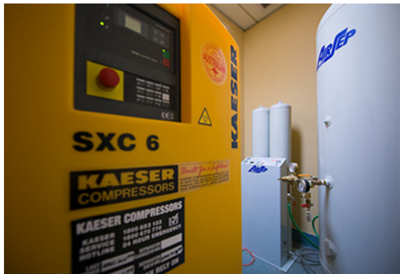
Caption: Compactly installed, the oxygen supply plant at the RSPCA Victoria's veterinary clinic in Burwood East, generates oxygen which is then available via a piping system into all of the surgery rooms.

Images: (contact the press office for high res copies of the following images)