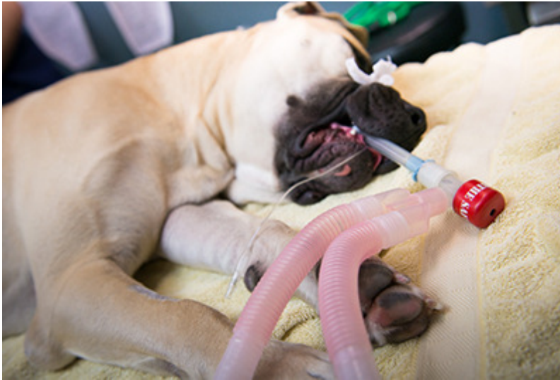
Caption: The RSPCA Victoria's veterinary clinic in Burwood East utilising the oxygen supply plant system to provide oxygen to Alfie in surgery.