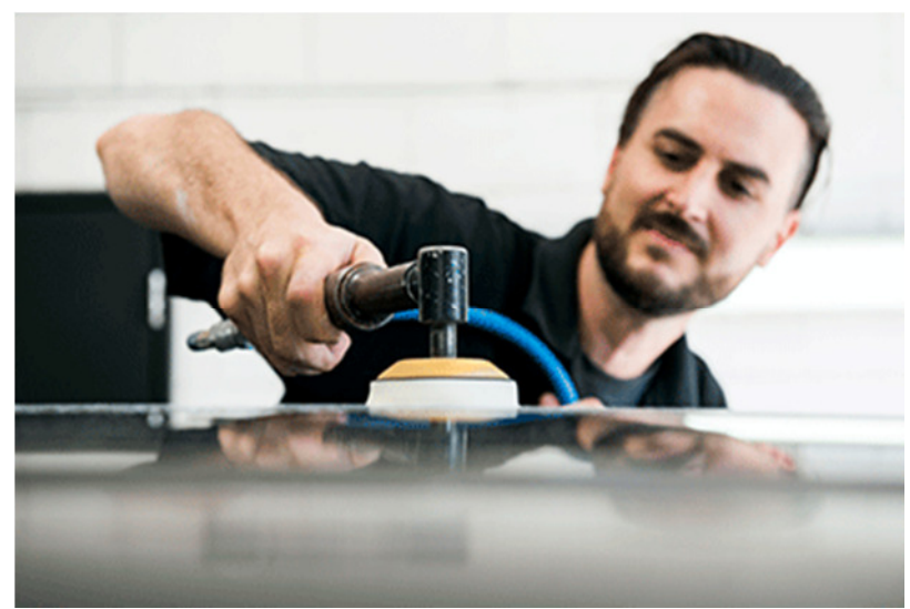
Caption: KBW is a leading vehicle repair company based in NSW