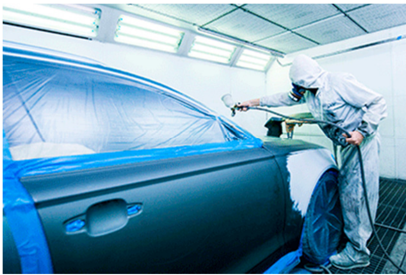
Caption: Compressed air is used extensively at KBW including powering the spray paint booth