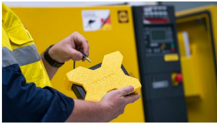
Caption: The Air Demand Analysis (ADA) measuring equipment logs a compressed air system for a fixed period of time.