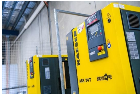
Caption: The Kaeser Aircenter SK25 and two Kaeser ASK 34 T's also in operation at Victor Footwear to meet the facilities compressed air requirements.