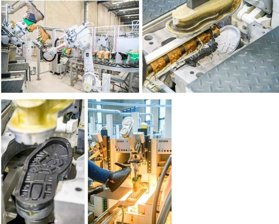
Caption: Representing the latest method of attaching soles to footwear uppers - here the advanced dual density soles of all Mongrel Boots are directly injected onto an upper.