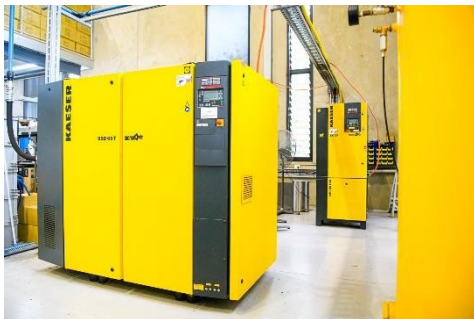
Caption: The Kaeser BSD 65 T selected to meet the additional compressed air requirements of the new direct injection moulding machine at Victor Footwear.

Images: Contact our press office to request high res versions of the images found below