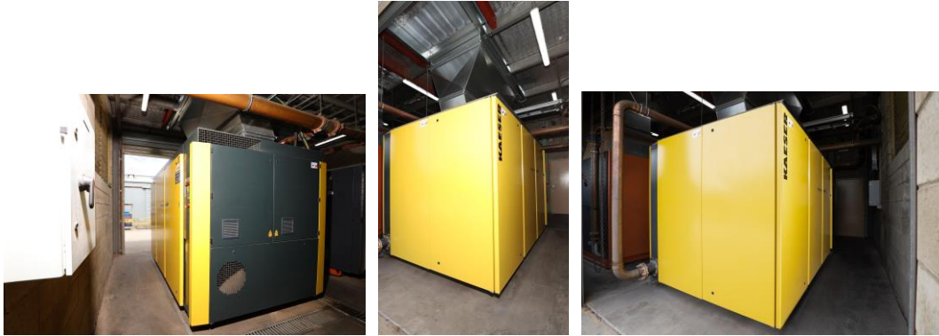
Caption: The new Kaeser compressor is assisting Geofabrics in continuing to meet its sustainability goals