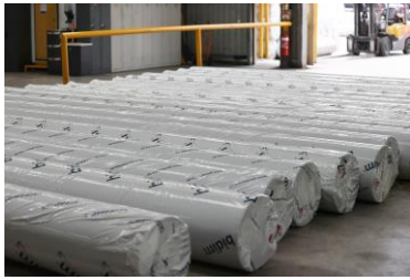
Caption: Geofabrics' products are a key component in building Australia's critical infrastructure. Pictured here, some end product wrapped and ready to be despatched.