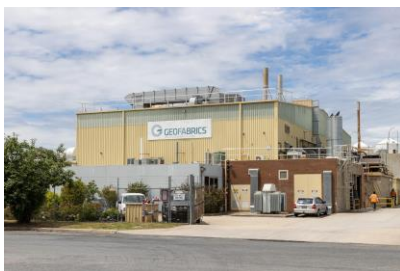
Caption: Geofabrics Australasia is Australia's largest manufacturer and supplier of a range of highly engineered geosynthetics for the building and infrastructure sector. Pictured here the manufacturing plant in Albury, Australia.