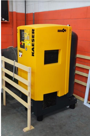
Caption: The Kaeser.SXC 8 all-in-one compressed air supply system at Fisher West Auckland.