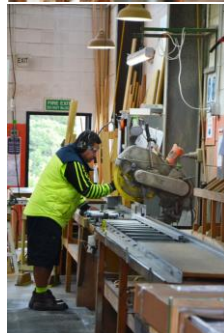
Caption: From the cutting machinery through to the air clamps and hand tools - compressed air is an essential utility required within many stages of the joinery building process at Fisher West Auckland.