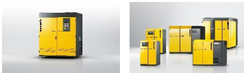
Caption: Turbo blower versus rotary screw blowers.