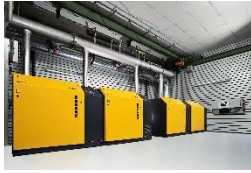
Caption: Modern rotary screw blowers can be arranged side-by-side