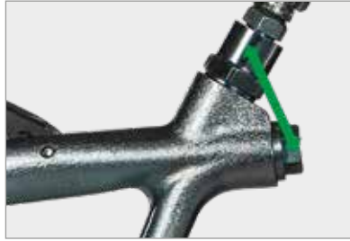
Male stud handle fitting