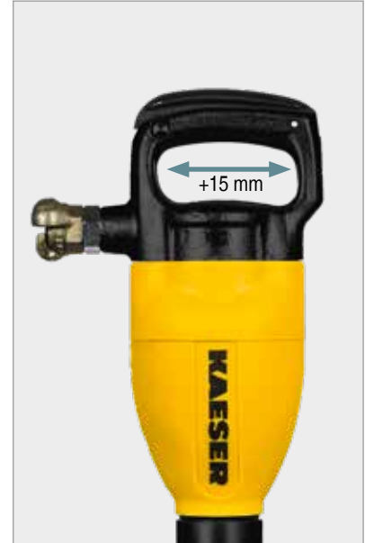
Wider grip aperture