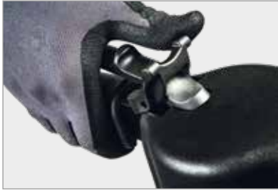
Ergonomic trigger lock