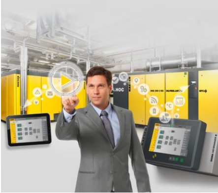
Caption: The SAM 4.0 compressed air management system binds all individual components into a complete team, monitoring and controlling them so that the required volume of compressed air is available at all times, at the required quality.