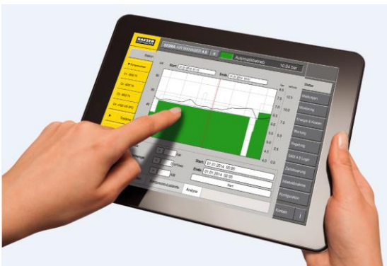
Caption: From a PC, laptop, tablet or smartphone - the SAM 4.0's integrated web server provides a visual display of all compressed air system data in the form of HTML pages.